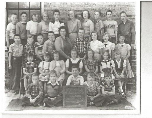
Riverside School Class September 1951