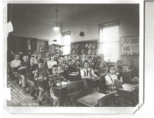
Riverside School Class Spring 1950