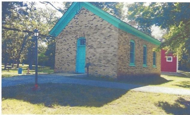
Whelan School Today

One-room schools have always shared a special place in the history of Franklin. Each school had been its own school district, but by 1950 residents voted for consolidation of these schools. They were sold at a public auction and eventually some of them became family homes.