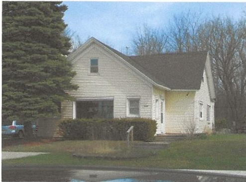
Stargard School Home Today