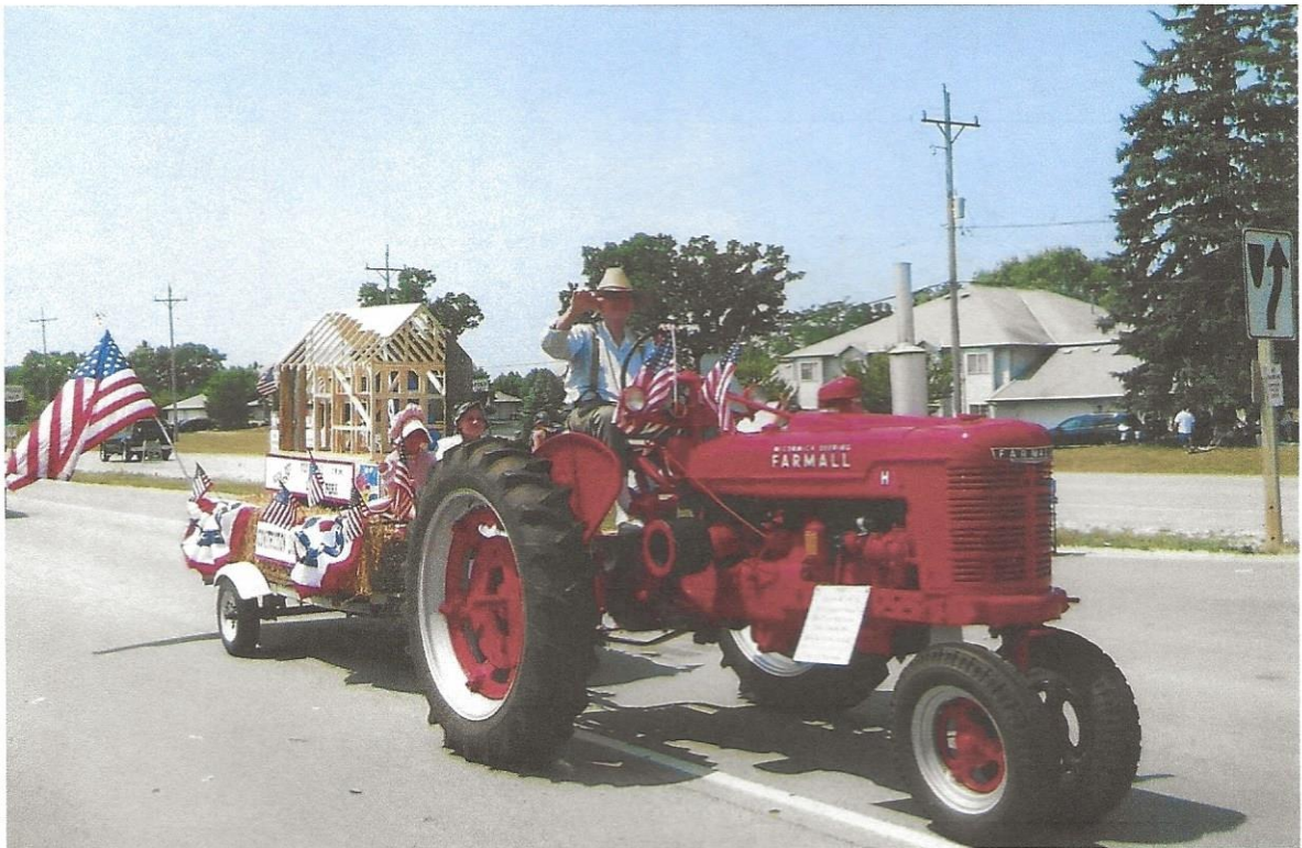
The Franklin Historical Society's parade entry, an antique farm tractor and barn float.

The 4th of July celebration and holiday is an important tradition of summer. The parades, rides and entertainment, family picnics in the park and the fireworks display are all a part of the holiday. It is how we as a nation continue to celebrate the founding of our country.