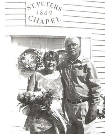
4 th of July Wedding

Please visit our website www.franklinhistory.net . We have added some new information about our activities, open house tours and pictures. We do have a face book that has the latest information about us.